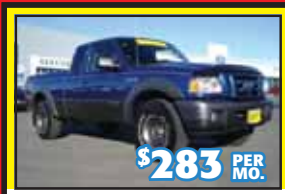
'07 FORD RANGER 71k Miles. Stk. #34491A • 60 mo.