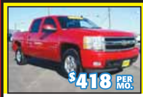
'07 CHEVY SILVERADO 47k Miles. Stk. #34524A