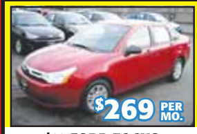
'10 FORD FOCUS 37k Miles. Stk. #35643