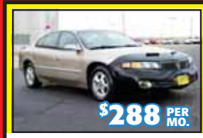
'02 PONTIAC BONNEVILLE 88k Miles. Stk. #35548AA • 36 mo.