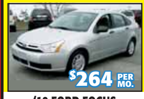
'10 FORD FOCUS 31k Miles. Stk. #35644