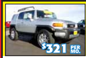
'07 TOYOTA FJ CRUISER 84k Miles. Stk. #35478A