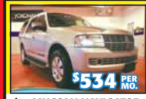
'07 LINCOLN NAVIGATOR 41k Miles. Stk. #35479