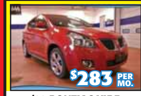
'09 PONTIAC VIBE 48k Miles. Stk. #35156A • 60 mo.