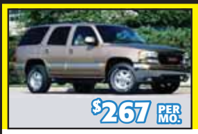
'00 GMC YUKON 120k Miles. Stk. #35527A • 48 mo.