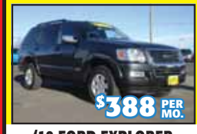
'10 FORD EXPLORER 30k Miles. Stk. #35645