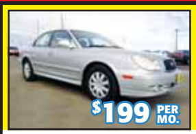
'04 HYUNDAI SONATA 104k Miles. Stk. #35580 • 36 mo.