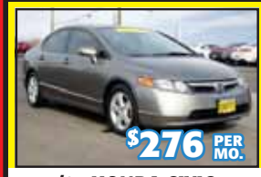
'07 HONDA CIVIC 70k Miles. Stk. #35605AA • 60 mo.