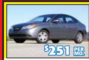
'10 HYUNDAI ELANTRA 32k Miles. Stk. #35636