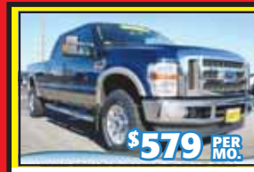
'10 FORD F-350 23k Miles. Stk. #35596A