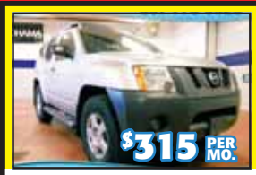
'08 NISSAN XTERRA 75k Miles. Stk. #34769A