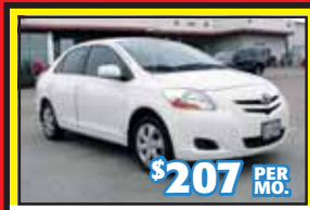
'07 TOYOTA YARIS 90k Miles. Stk. #35575A • 60 mo.