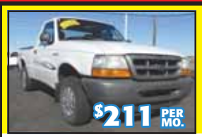
'98 FORD RANGER 111k Miles. Stk. #35123A • 36 mo.