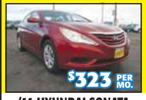
'11 HYUNDAI SONATA 30k Miles. Stk. #35578