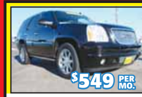
'08 GMC YUKON 39k Miles. Stk. #35565A