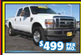
'08 FORD F-350 42k Miles. Stk. #34261A