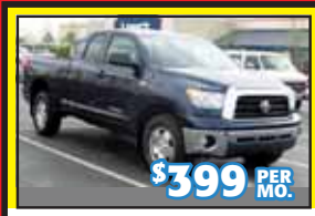
'07 TOYOTA TUNDRA 60k Miles. Stk. #35476A