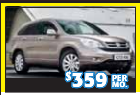
'10 HONDA CRV 27k Miles. Stk. #35495A