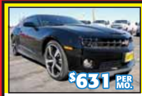
'11 CHEVROLET CAMARO 5k Miles. Stk. #K35031