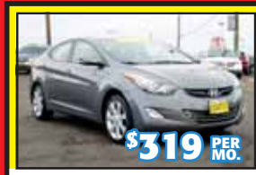
'11 HYUNDAI ELANTRA 11k Miles. Stk. #34607A