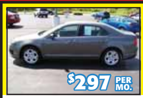
'11 FORD FUSION 33k Miles. Stk. #35647