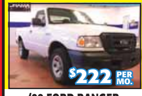
'09 FORD RANGER 45k Miles. Stk. #35312AA