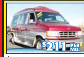
'99 FORD CONVERSION VAN 74k Miles. Stk. #35389B • 36 mo.