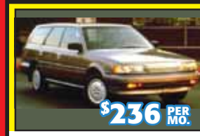
'89 TOYOTA CAMRY 158k Miles. Stk. #35036AA • 36 mo.