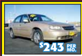
'02 CHEVROLET MALIBU 84k Miles. Stk. #35516A • 36 mo.