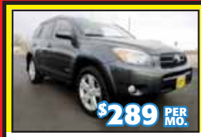
'07 TOYOTA RAV 4 71k Miles. Stk. #35476B