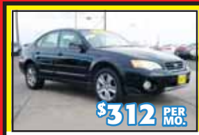
'06 SUBARU OUTBACK 61k Miles. Stk. #35283AA • 60 mo.