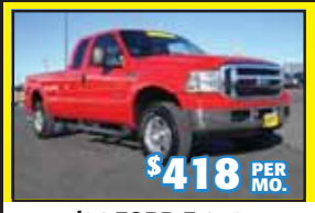
'06 FORD F-250 50k Miles. Stk. #35407AA • 60 mo.