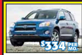
'11 TOYOTA RAV4 26k Miles. Stk. #35615A