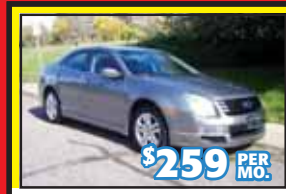
'08 FORD FUSION 38k Miles. Stk. #35600