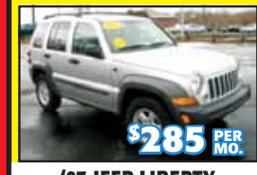
'07 JEEP LIBERTY 80k Miles. Stk. #35646 • 60 mo.

Payments based on 72 months unless otherwise noted and are based on 20% (*) down. W.A.C. Picture shown may not represent actual vehicle. Additional discounts may apply for hail damaged units.