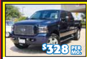
'05 FORD F-250 114k Miles. Stk. #35335A • 60 mo.