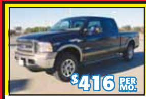
'06 FORD F-250 34k Miles. Stk. #35448A