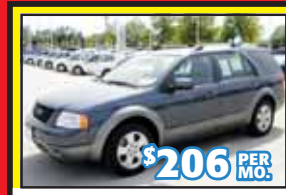
'05 FORD FREESTYLE 97k Miles. Stk. #34877A • 60 mo.