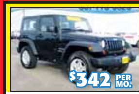
'10 JEEP WRANGLER 9k Miles. Stk. #35211A