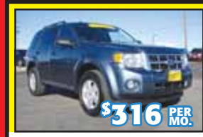
'10 FORD ESCAPE 51k Miles. Stk. #35599